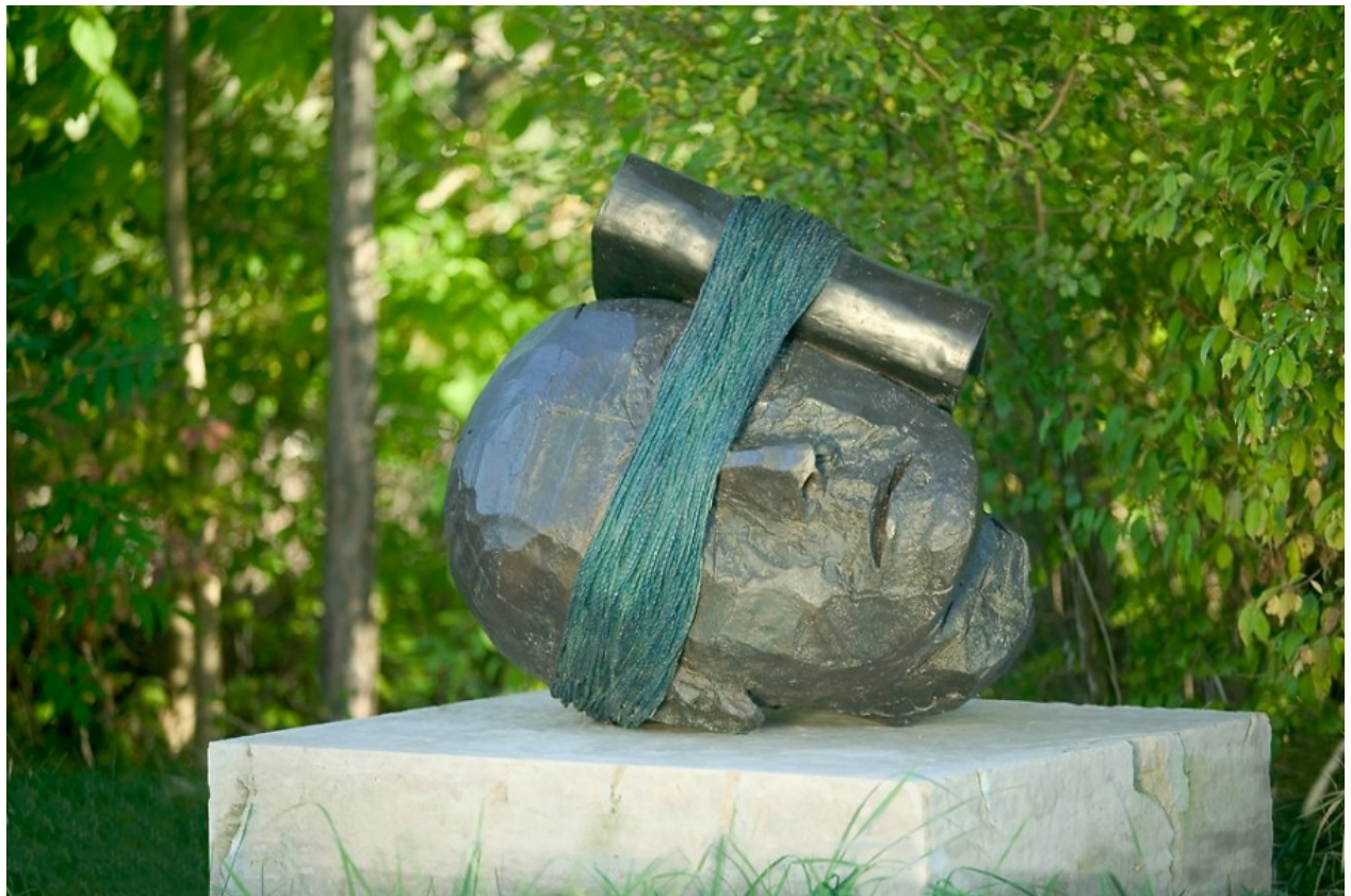
Bill Woodrow. Listening to History , 1995 (cast 2001). Bronze, 29.5 x 26.75 x 31 inches.